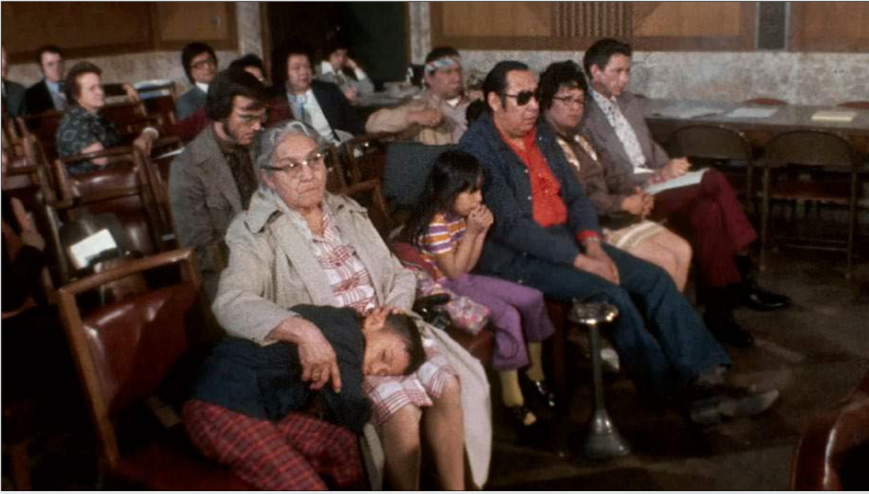
April 8, 1974, Washington, D.C. U.S. Senate Hearings on Indian child welfare.