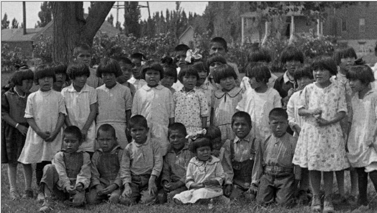
1929 Navajo Reservation.

The Wabanaki, "People of the Dawn," are organized in a confederacy of tribal nations in Maine and Atlantic Canada . They are among the thousands of Indigenous societies that have inhabited Turtle Island for millennia. After European colonizers and fortune-seekers occupied much of the land known by its First Peoples as Turtle Island, they renamed it North and South America, and entire tribal nations were forcibly removed from their ancestral homelands due to the uncontrolled expansion of settler colonies, towns and cities. Despite early and short-lived instances of coexistence, settlers disregarded treaties, spread catastrophic new diseases, and forced children and adults into indentured servitude and slavery. Violence, occupation, and war came to define the early relationship between settlers and Native communities.