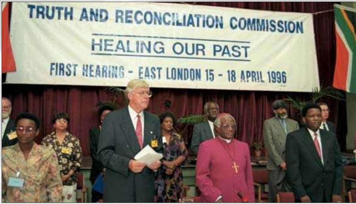
April 1996, East London, South Africa, Members of South Africa's Truth and Reconciliation Commission at the commission's first hearing.